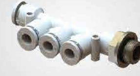
MULTI "TEE" CONNECTOR