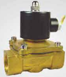
DIAPHRAGM SOLENOID VALVE: UW SERIES (G1/2" TO G2")