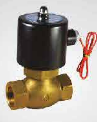
HIGH TEMPERATURE SOLENOID VALVE (G1/2" TO G1")