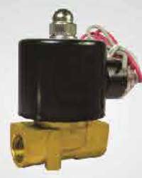
DIRECT ACTING SOLENOID VALVE (G1/4" & G3/8")