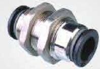
BULK HEAD CONNECTOR