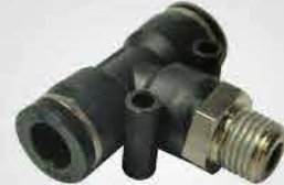
MALE BRANCH "TEE"