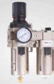
AC SERIES (FR + L) (G1/4" TO G1") (UPTO 10bar)