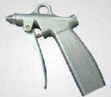
METAL AIR GUN