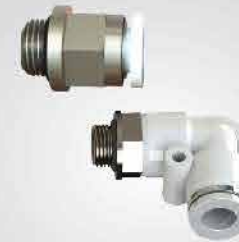
STRAIGHT CONNECTOR & ELBOW CONNECTOR