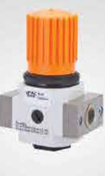
FAR SERIES AIR REGULATOR (G1/4" TO G3/4") (UPTO 16bar)