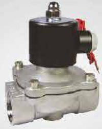
DIAPHRAGM SOLENOID VALVE (SS BODY) (G1/2" TO G2")