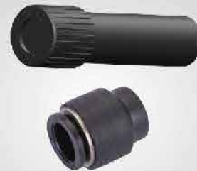
BLANKING PLUG & DEAD PLUG