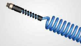
PU TUBE - RECOIL WITH SWIVEL CONNECTOR