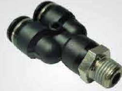
MALE BRANCH "Y"