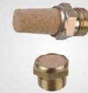
METAL SILENCER & MINI-METAL SILENCER