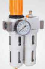
FAC SERIES (FR + L) (G1/4" TO G3/4") (UPTO 16bar)