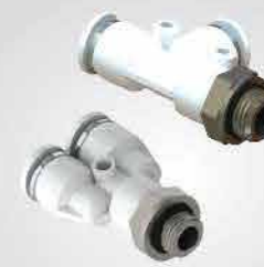
MALE BRANCH "TEE" & MALE BRANCH "Y"