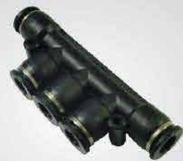
EQUAL MULTI "TEE"