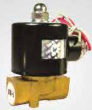
DIRECT ACTING SOLENOID VALVE - UNID (G1/4" & G3/8")