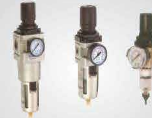
AW SERIES (FR) (G1/4" TO G1") (UPTO 10bar)