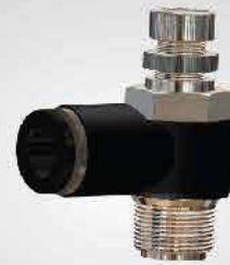
FLOW CONTROL VALVE