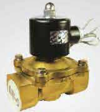
DIAPHRAGM SOLENOID VALVE - UNID (G1/2" TO G2")