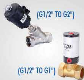
AIR PILOT VALVE (FOR AIR, WATER, OIL, STEAM) (G1/2" TO G1")