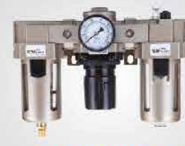
AC SERIES (FILTER(F) + REGULATOR(R) + LUBRICATOR(L)) (G1/4" TO G1") (UPTO 10bar)