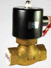
HIGH TEMPERATURE SOLENOID VALVE - UNID (G1/2" TO G1")