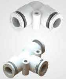
EQUAL ELBOW & EQUAL "TEE"