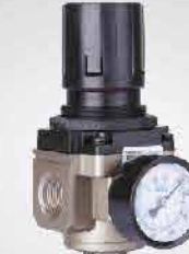
AR SERIES AIR REGULATOR (G1/4" TO G1") (UPTO 10bar)